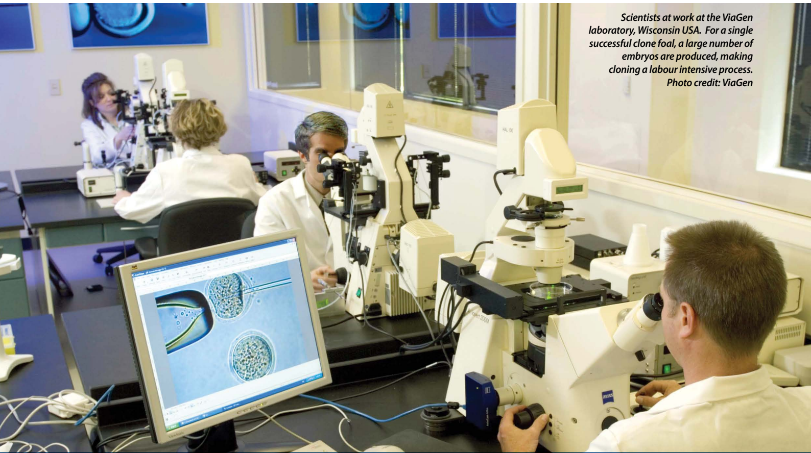
Scientists at work at the ViaGen laboratory, Wisconsin USA. For a single successful clone foal, a large number of embryos are produced, making cloning a labour intensive process.