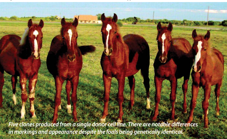
Five clones produced from a single donor cell line. There are notable differences in markings and appearance despite the foals being genetically identical.

on or off for embryo development to continue. It has taken years to develop a successful method for this, however for many of the embryos it is all too much change in too short a time period, again contributing to a fairly low efficiency.