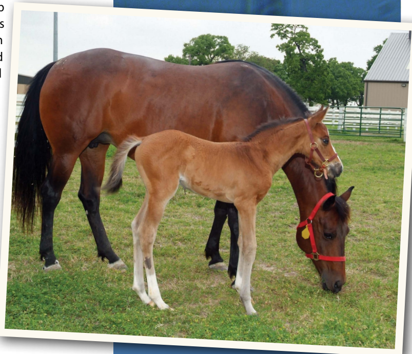
“Paris Texas”, USA’s first cloned foal, produced by scientists at Texas A&M University. The first successful cloning of a horse took place in Italy in 2003.